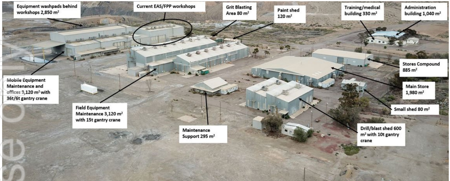
Figure 1: Aerial photo of buildings, labeled with sizes